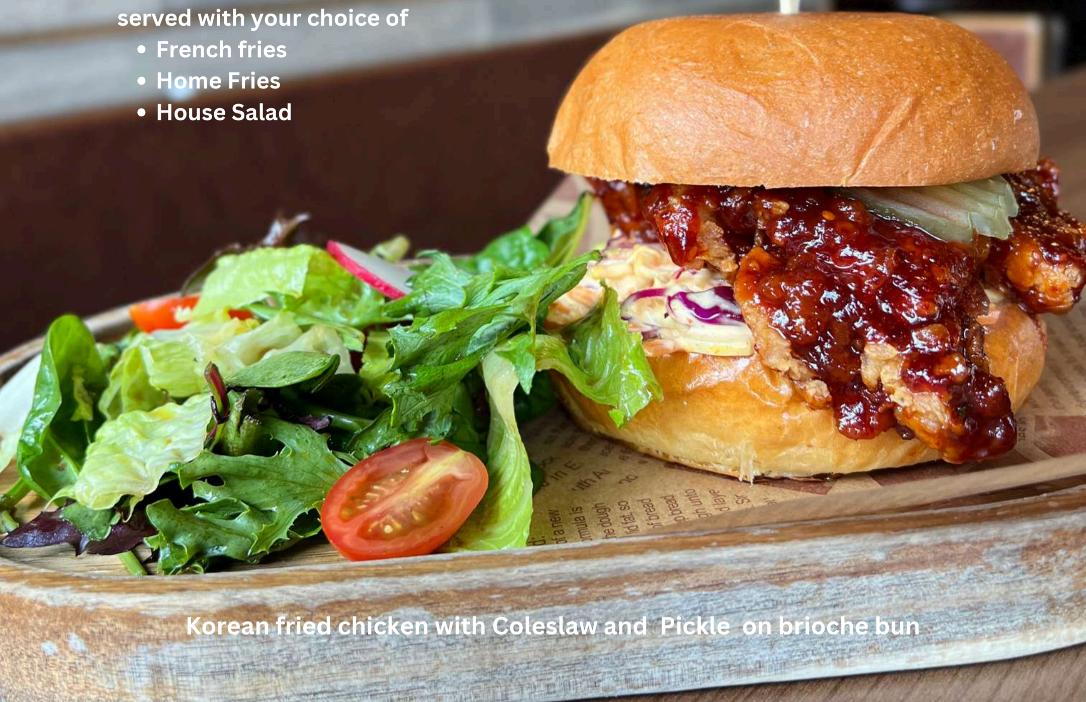
Korean fried chicken with Coleslaw and Pickle on brioche bun